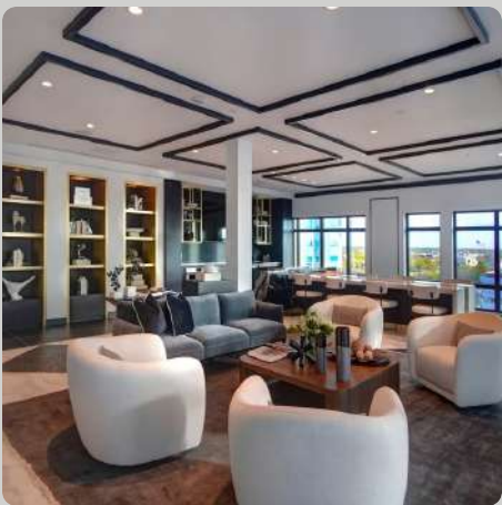
SKY LOUNGE WITH SUNSET VIEWS