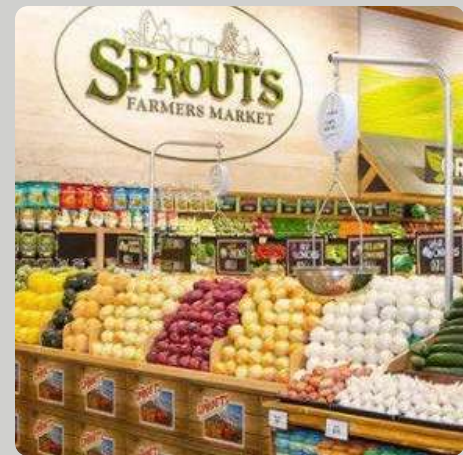
SPROUTS FARMERS MARKET CONVENIENTLY LOCATED ON THE GROUND FLOOR