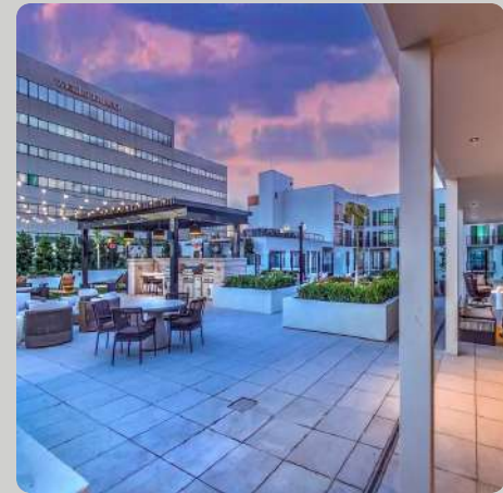
LOUNGE AREAS & ROOFTOP TERRACES