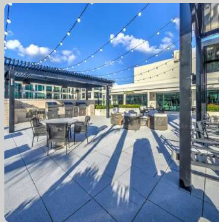
BBQ GRILLS & COURTYARDS FOR OUTDOOR GATHERINGS