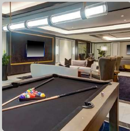
CLUBROOMS & CO-WORKING SPACES